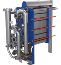
Two-stage freshwater generator AQUA Blue E2