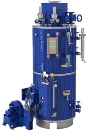
Methanol-ready steam boiler system type Aalborg OS-TCi