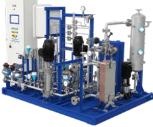
Fuel supply system FCM Methanol