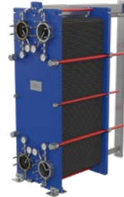
Marine gasketed plate heat exchanger