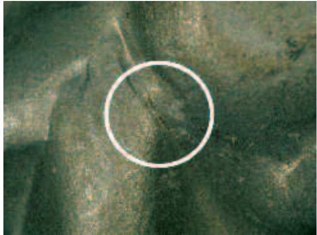
Close-up image of crack found in a plate.

Alfa Laval support ensured that the customer's heat exchanger was replaced with a new unit that has many more years of reliable service ahead.